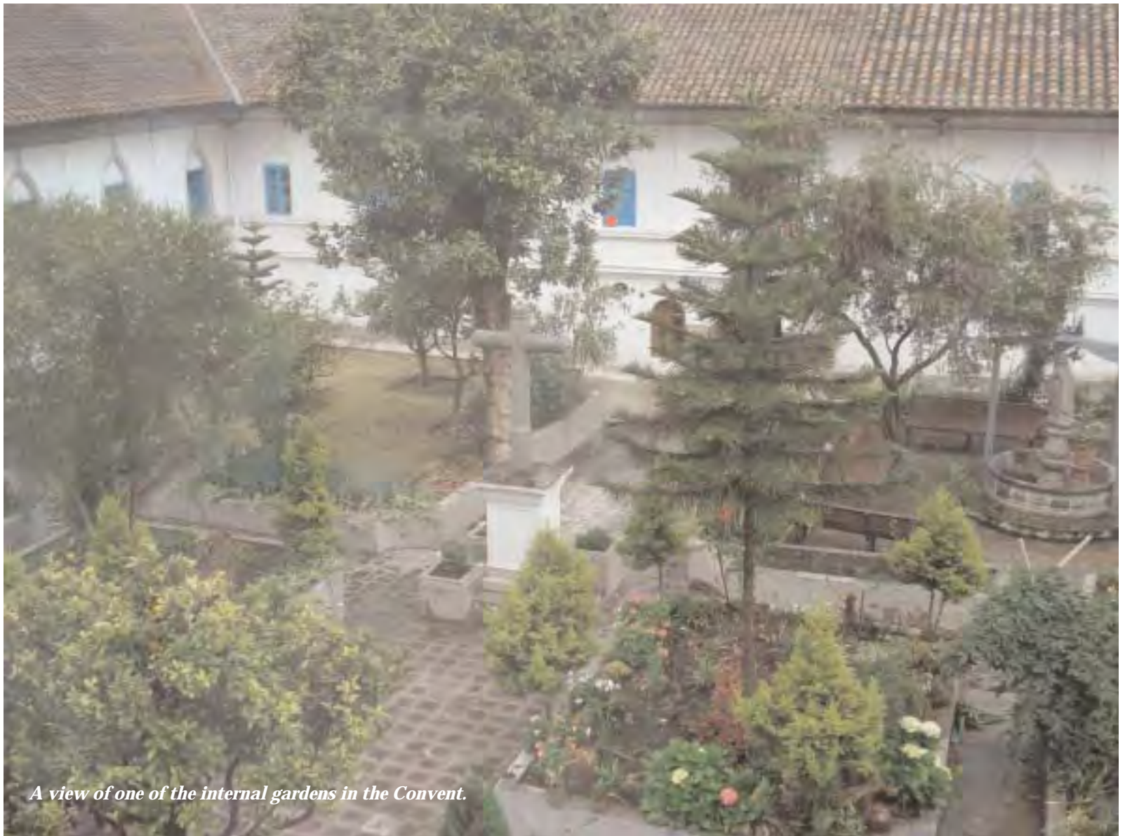
A view of one of the internal gardens in the Convent.