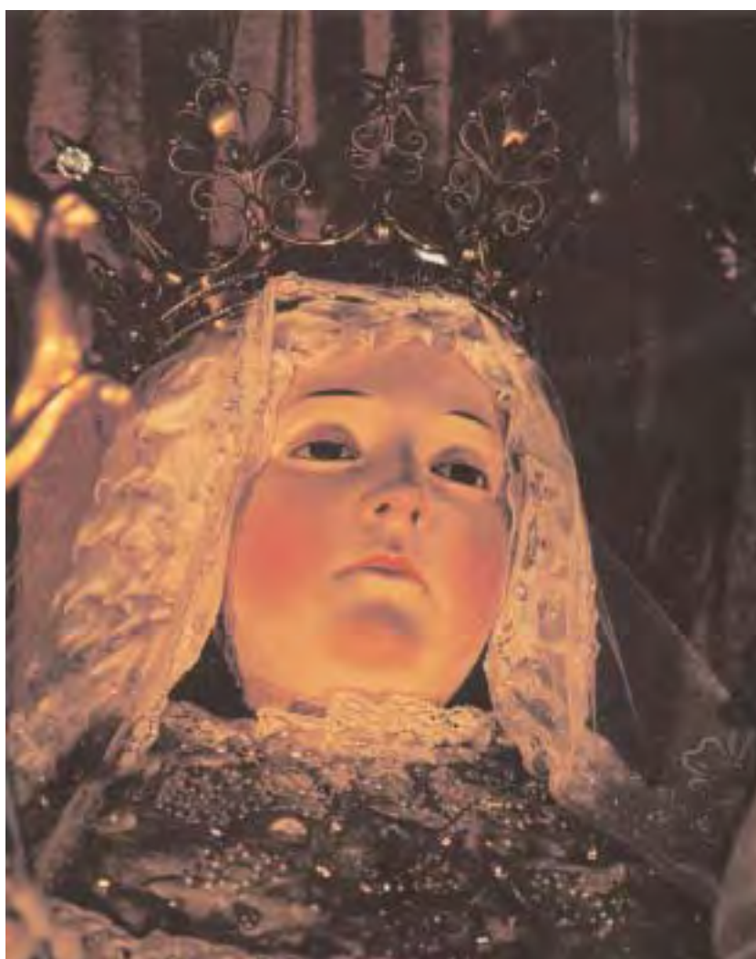
Countenance of Our Lady of Good Success venerated in the Convent of the Immaculate Conception of Quito.