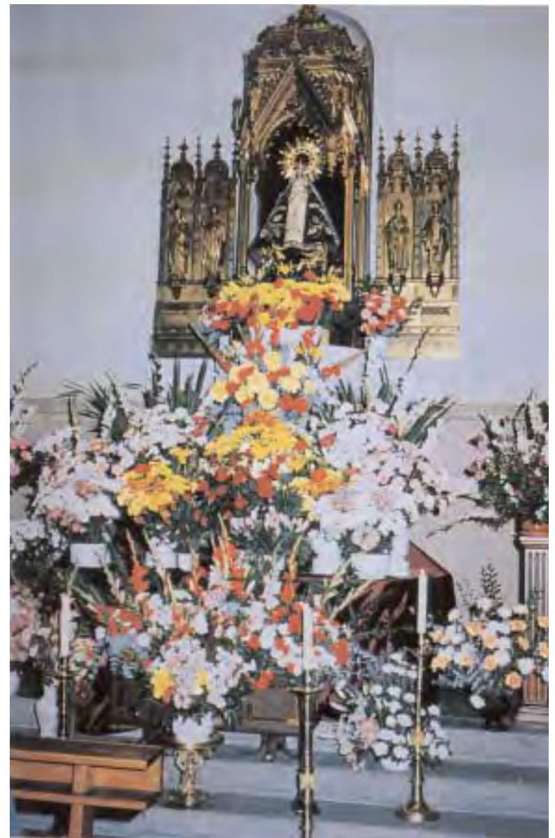
During the annual feast day in honor of Our Lady of Good Success , that is held on the last Sunday of October, it is a custom to make a floral offering before the sacred Statue of Our Lady of Good Success .

On June 6, 1611, King Philip II made the dedication of the new church and, in the presence of the Queen and the whole Court, placed the Statue of Our Lady of Good Success in the church, above the third chapel. Then, on September 19, 1641, with a solemn ceremony, the sacred Statue, which gave its name to the Hospital of the Court and to its church, was placed above the main altar.