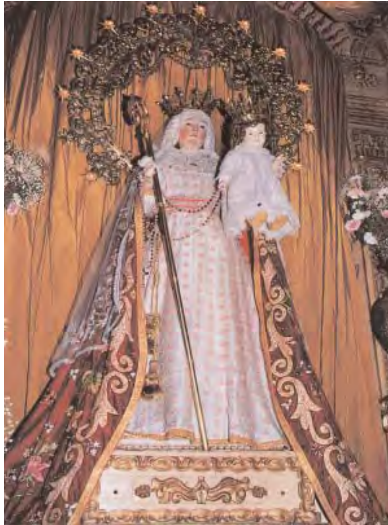
Our Lady of Good Success venerated in the Convent of the Immaculate Conception of Quito.

“My Lady, I entrust to your maternal love my sons and daughters of the three Orders I founded, that continue on their earthly pilgrimage. I deliver to you today and for all times this Convent established under