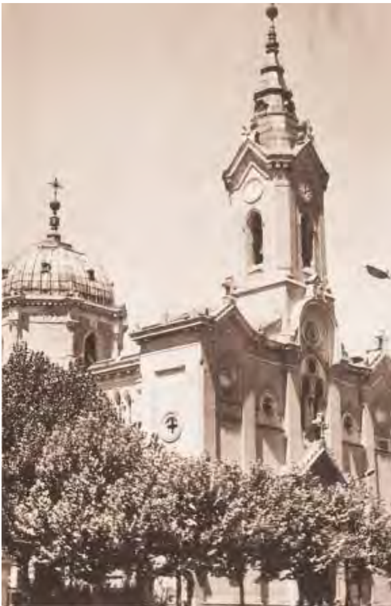
View of the Church of Good Success , ordered by Queen Isabella II of Spain, and built in Madrid, in 1868, in “Via de la Princesa”, before the “ Hospital Central del Aire ” (Military Hospital).

Then, Pope Paul V blessed the Statue, granted Her many indulgences, gave her the name of “ Our Lady of Good Success ” and commanded that Her devotion had to be promoted at once. In memory of the pectoral cross which Paul V had placed on Our Lady of Good Success , He authorised the Friars, of the Order to use a cloth cross on their black tunic. At the end, Paul V decreed that the “ Religious Congregation of Minims for assistance to the sick ” was erected to Religious Order .