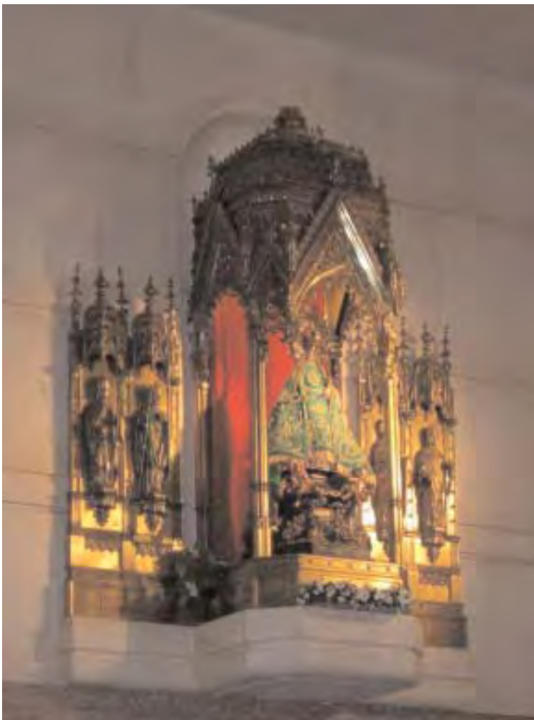
View of the sacred Statue of Our Lady of Good Success , located above the side altar of the Church of Good Success at the " Hospital Central del Aire " (Military Hospital) of Madrid.

those places, new and magnificent buildings had risen.