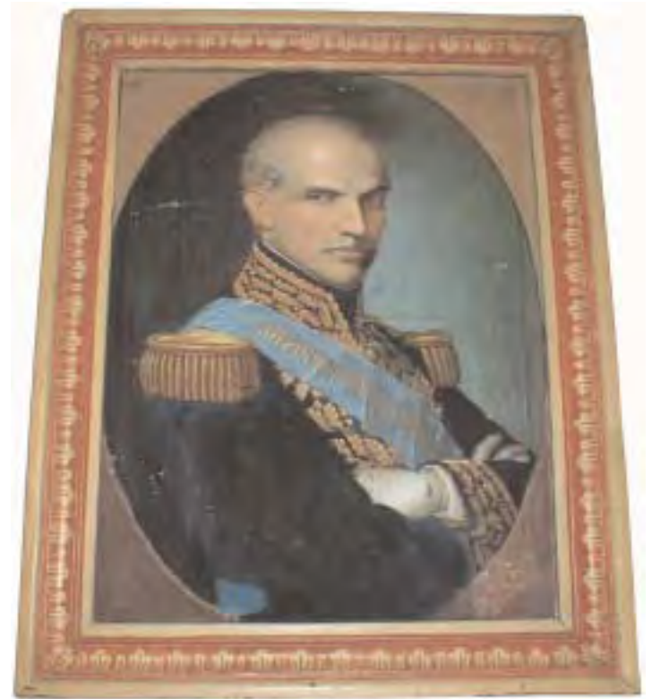
Portrait of Gabriel Garcia Moreno , Catholic President of the Republic of Ecuador. For having consecrated Ecuador to the Sacred Heart of Jesus , he was murdered by Masonry, but, for his courageous and deeply Christian act, God has preserved his heart which, after more than 130 years from death, is still incorrupted!

These years, during which the accursed sect of Masonry will take control of the civil government, will see a cruel persecution of all religious communities, and will also strike out violently against this one of mine.