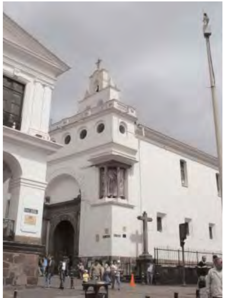
Main entrance to the Church of the Immaculate Conception in Quito, where Our Lady of Good Success is publicly venerated three times a year.

Our Lord addressed her, saying: «My Spouse, I desire for you a life of immolation. Your life will be a continuous martyrdom».