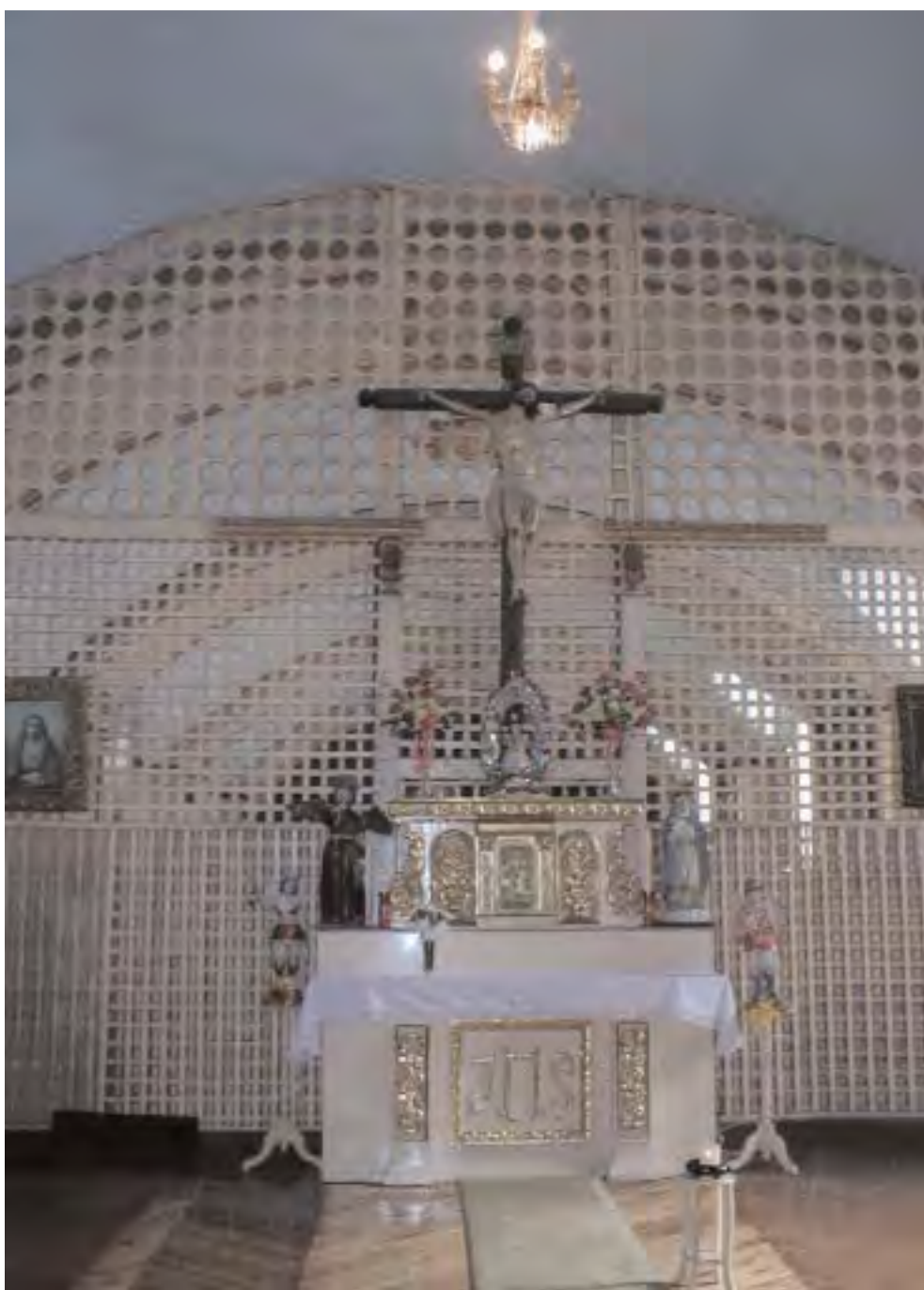
The Upper Choir loft of the Convent of the Immaculate Conception of Quito, where Mother Mariana would often pray, prostrate before the Tabernacle.