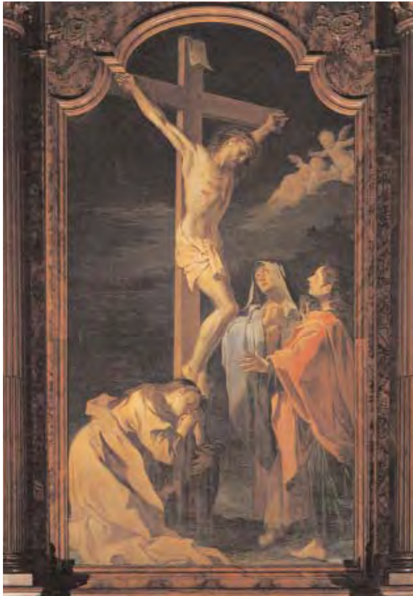
Jesus in agony, with the Virgin Mary, St. John and St. Mary Magdalene at the foot of the Cross.

«Have recourse to Her in all your spiritual and temporal needs. When your soul suffer temptations and hardships, and if the star of the divine vocation, by divine permission, is hidden from your soul's sight, run to Her with confidence and say: