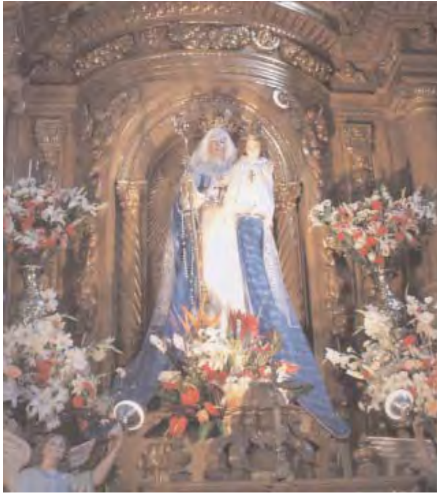
Our Lady of Good Success in the niche about the altar. She is publicly venerated during the Novena January 24 th / February 2 nd .

Amid this great happiness, the Queen of the Angels approached the Statue and entered into it , just as the rays of sun penetrate beautiful crystal. At that moment, the holy Statue took on life and sang the Magnificat with a celestial voice. This took place at 3 o'clock in the morning».