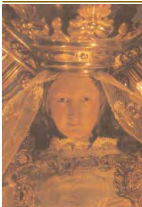
Countenance of the Statue of Our Lady of Good Success placed above the main altar of the church dedicated to her, in Madrid.

At the age of seven, a fire broke out in the church destroying it and damaging her house and paternal property, precipitating the family into poverty. The parents of the young girl found themselves obliged to leave Viscaya and to relocate themselves and their three children to Santiago of Galicia, in the north-western part of Spain.