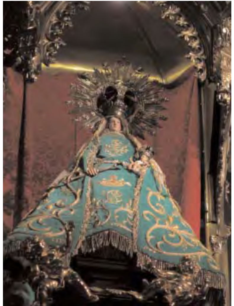
The sacred Statue of Our Lady of Good Success , found by the two “Obregones” Brothers in a cave around Traiguera, and, at present, located in the Church of Good Success in Madrid.

Pope Paul V received the two Brothers and heard the story of the discovery of the Statue. Understanding the supernatural nature of the event, He knelt down, put his pectoral cross around the neck of the Statue, embraced and kissed Her and exclaimed: «Look, She smiles! Why is She smiling? What a Good Success you have achieved with this trip! There is no doubt that Our Lady has decided to protect you and support you in your work. So I am not the one to go against Her. May your wishes have a Good Success! ».