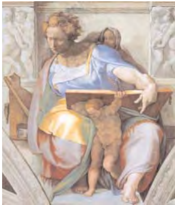
The prophet Daniel.

magaddon is upon us. And believers in Jerusalem will flee to the mountains or among the rocks of Petra, mindful of the Divine promise (Mt. 24: 16).