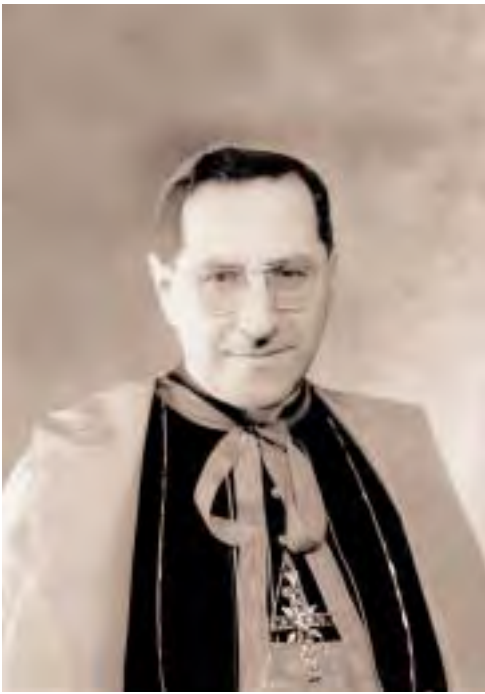
Card. Giuseppe Siri in 1955.

The “new path” was found in 1958: Card. Siri was elected as Pope Gregory XVII , but with terrible threats, he was forced to step down, giving way to the Mason, John XXIII , that all the cardinals knew to be the necessary step for the elevation to the papacy of Bishop. G.B. Montini, the favorite of the Masonic world . Since his resignation was invalid, Gregory XVII remained the true Vicar of Christ until his death (1989). In this period, therefore, the throne of Peter was occupied by Antipopes.