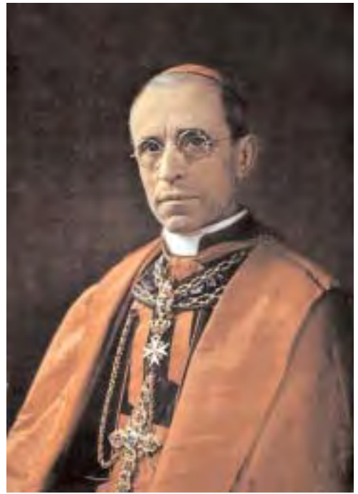
Pope Pius XII.

And aren't the key points of the political program of the Satanic Order of the Bavarian Illuminati , those ones that suppress the loyalty to our Home-