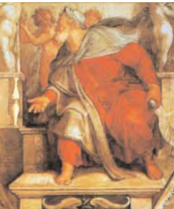
The prophet Ezeckiel.

of Israel) like a tempest, with chariots, and with horsemen, and with a great navy, and he shall enter into the countries. » (Daniel 11: 40).