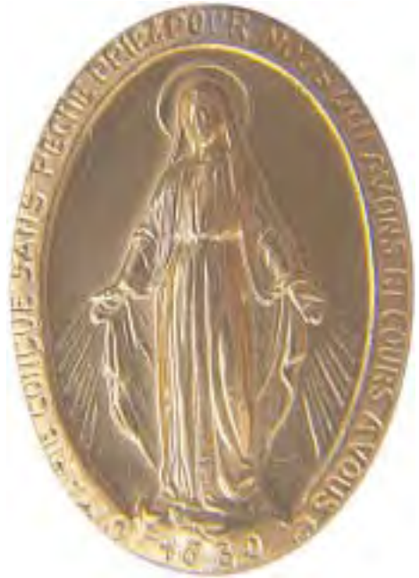
The Miraculous Medal that Our Lady offered to us in Paris in 1830, the period in which the Satanic Order of the Illuminati of Bavaria was plotting its blackest conspiracies against the Church of Christ!

This aid will be powerful, because the angel bears the title of “mighty.”