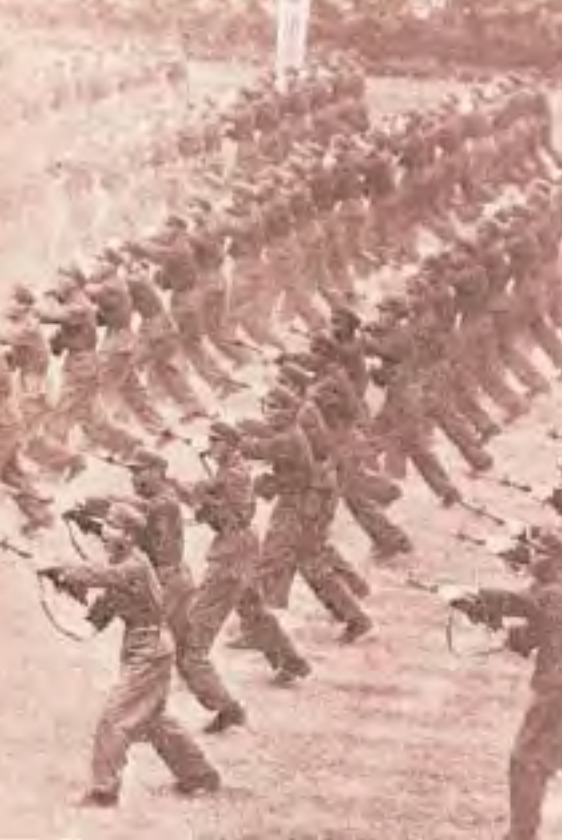
A Chinese army unit exercises in preparation for hand to hand combat.

launch a takeover of the world. The number of these soldiers, who will advance by land, will be immense: there will be millions and millions of soldiers that China has prepared and planned for a long time, for this war of conquest.