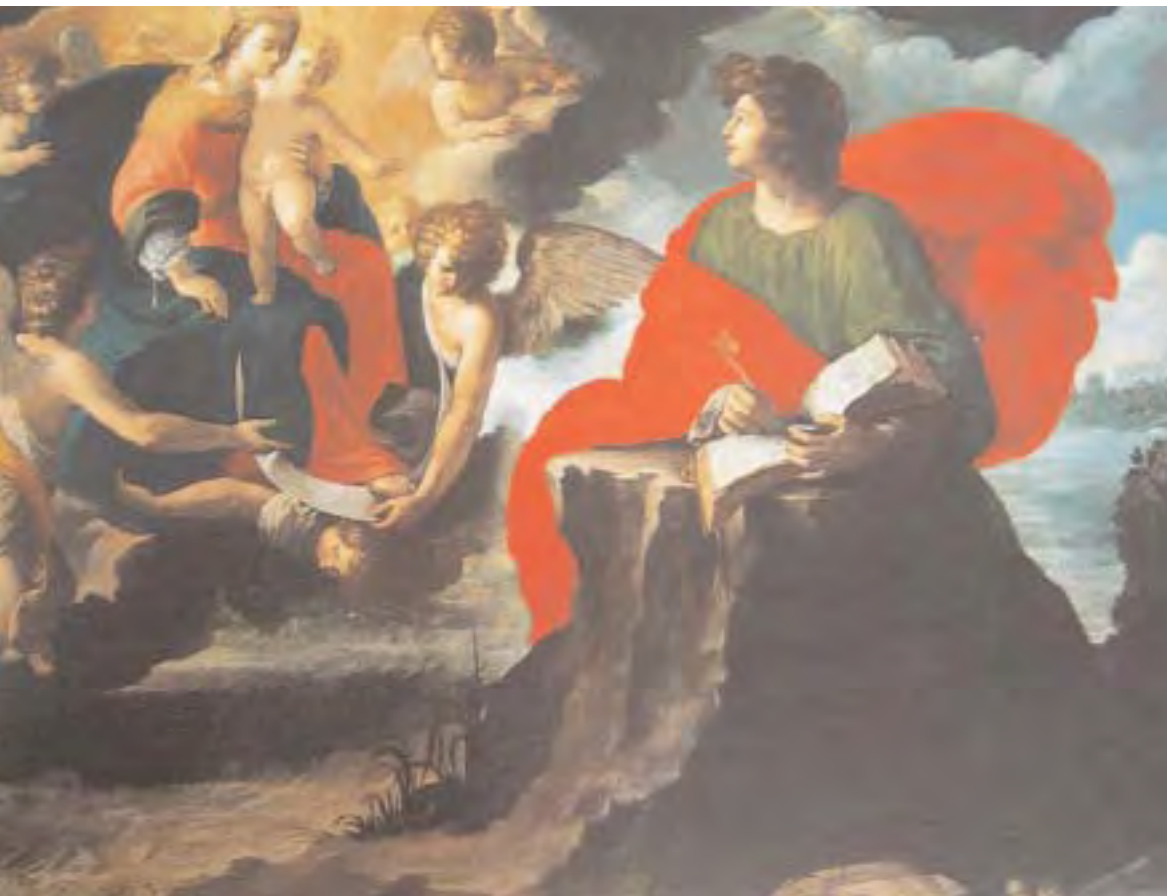
St. John and the vision of the “mighty” Angel, symbolizing God’s intervention through the Apparitions of Our Lady, in which She comes to inform us of the tragedies of the Church of Christ, but also of Her final triumph.

By the attributes under which the angel is presented, in particular, the cloud and the rainbow , the prophetic figure of Mary comes to mind.