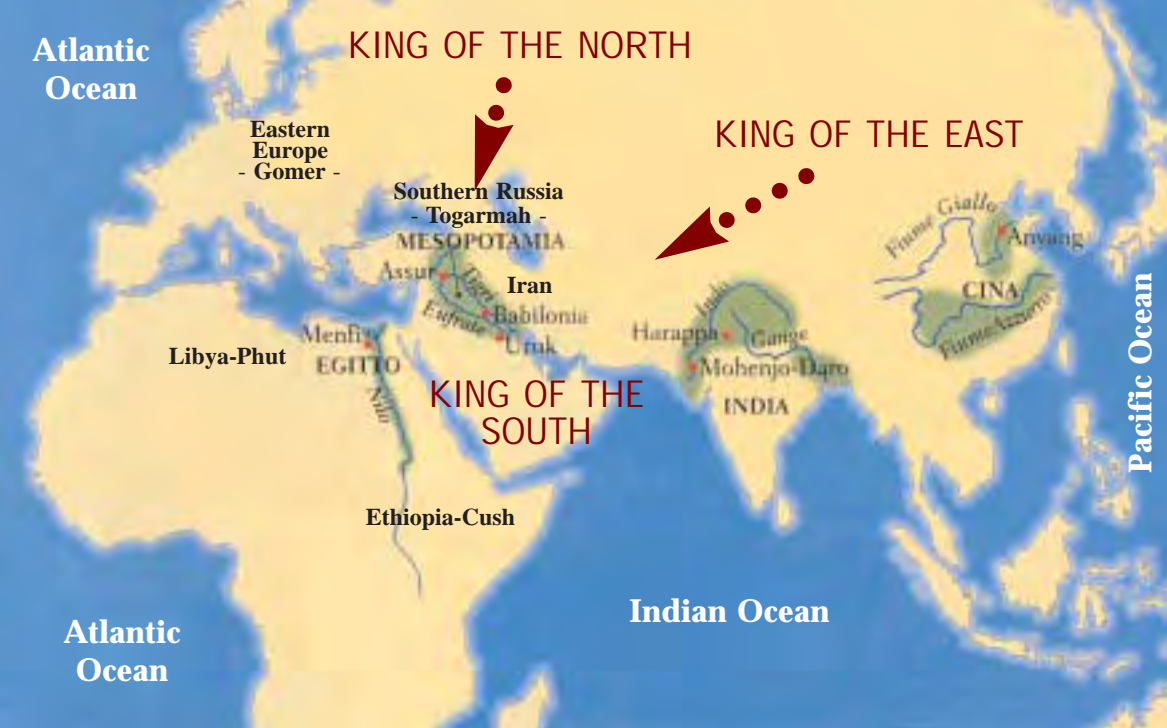
Map of the Euro-Afro-Asian Continent.

Poland, Czechoslovakia and East Germany to the Danube. The same geographical framework it is also confirmed in the modern Talmud.