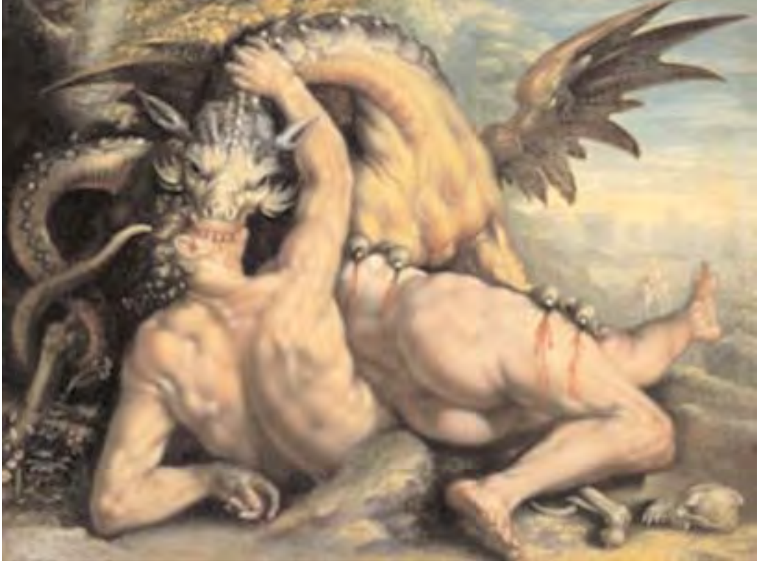
The Dragon of the Apocalypse.