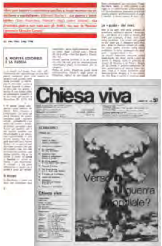
In Chiesa viva n. 57, October 1976, an article appears: “The Prophet Ezeckiel and Russia,” which is about the Third World War.

It states, namely, that the dry bones «are the whole house of Israel who, without hope, is dispersed among all the nations of the world» (Ezeck. 37; 11); and that in these bones,