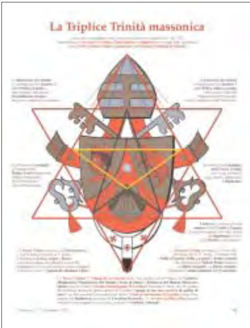
Page 23 of “The Antichrist in the Church of Christ?,” in which the Masonic Triple Trinity appeared on the coat of arms of Pope Benedict XVI where Benedict XVI was depicted as the Second Beast of the Antichrist .

from the earth , also called Patriarch of Freemasonry, Supreme Pontiff of Universal Freemasonry, Supreme Head of the Order of the Bavarian Illuminati and Patriarch of the World .